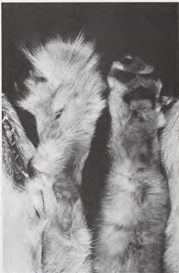
Fig. 3: Right forefoot of an ad. ♂ Vulpes cana (study skin ZFMK 93.354) (right) and (left) forefoot of an ad. ♀ Vulpes rueppelli (study skin ZFMK 89.101), both from Egypt. The diagnostic difference between the two species in the length of the palmar (and plantar) hair is marked. In V. rueppelli this hair is long, forming a cushion as an enlarged tread which conceals the footpads. In V. cana this hair is much shorter and does not form such a cushion, so the footpads are visible.

and in V. rueppelli may also not have been sufficient ( n = 4-9 ) to be fully representative of the respective populations. These data and those published by Osborn & Helmy (1980), Gasperetti et al. (1985), Mendelsohn et al. (1987), and Harrison & Bates (1991) document that (certain) cranial measurements of V. rueppelli vary considerably over parts or perhaps the whole of its distributional range and that for some populations they (partly) overlap with those of V. cana . As stated above, the actual range of variability in these measurements in Blanford's fox is not established yet. It is very likely that occasionally this situation led to incorrect identifications of museum specimens of the latter species as V. rueppelli if the decision was or had to